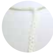
SAFETY NET - LIGHT TYPE Weight 1000MD x1mt: 17,11kg