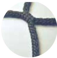
SAFETY NET - STANDARD TYPE Weight 1000MD x1mt: 20,18kg